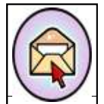
image borrowed from Flemington-Raritan Regional School District (NJ) website

By now, you know that your email address has been added to the new LWVCNMTopics mailing list. All member email addresses that were on file were added to the listserve in early February, to give everyone a chance to check it out. The "add" process short-circuits the old "invite" method where you need to reply to the message to get on—basically, nobody did. If you want to get off the list, all you need to do is send an email message to: LWVCNMTopics-unsubscribe@yahoogroups.com But we hope that you don't!