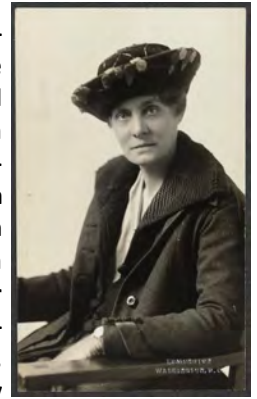
Ella St. Clair Thompson

The parade coincided with a visit from Mrs. Ella St. Clair Thompson, an organizer from the National Woman's Party (NWP, known until 1916 as the Congressional Union). The NWP had been founded by Alice Paul and focused on securing an amendment that prohibited voting discrimination based on sex. Unlike women in the rest of the American West, suffragists in New Mexico focused on a national amendment, rather than a state law. Although they had fought for full suffrage to be included in the constitution when New Mexico became a state in 1912, they had been unsuccessful. Also, in order to protect the Spanish language provisions and religious freedoms for Catholics written into the document, the members of the constitutional convention had deliberately made the constitution extremely hard to amend. Any changes required the votes of two-thirds of the legislators, followed by three-fourths voter approval in each county. While the men of the convention had included women's voting rights in school elections in the constitu-