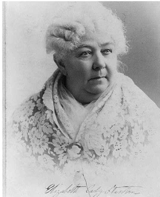
Elizabeth Cady Stanton