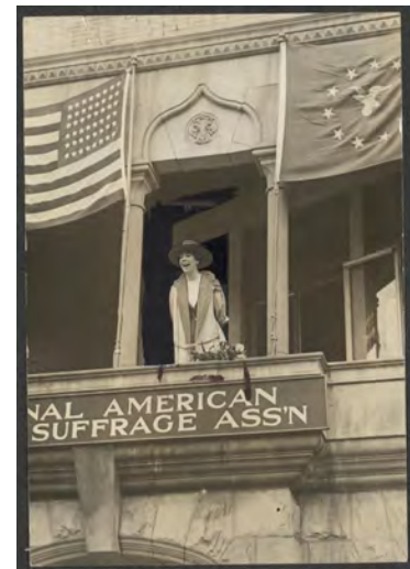
Jeanette Rankin, first woman elected to U.S. House of Representatives, 1916 from Montana