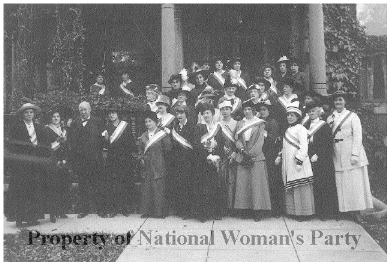
New Mexican Suffragists in 1915 (National Woman's Party)

The suffrage marchers in Santa Fe deliberately took up space as they traced the political geography of New Mexico's capital city. They began just off the plaza in the center of town, bounded by the old Palace of the Governors, the former site of Spanish and then Mexican power. They then marched south, circling the state capital building before heading back towards the center of town, across the plaza and north around the federal building. Hundreds of people turned out to watch them make their statement in support of women's voting rights.[2]